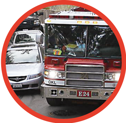
Navigate tight roads

BCA22option-PX1 Video, TrueSight, Wireless Sensor Proximity w/Display, 2 Cameras