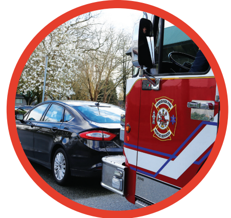
Maneuver into compact parking spaces