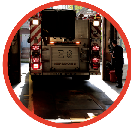
Easily back up into narrow parking bays