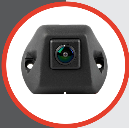
Ultra-wide 1080p Camera with Housing (4)