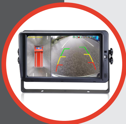
High Resolution Monitor