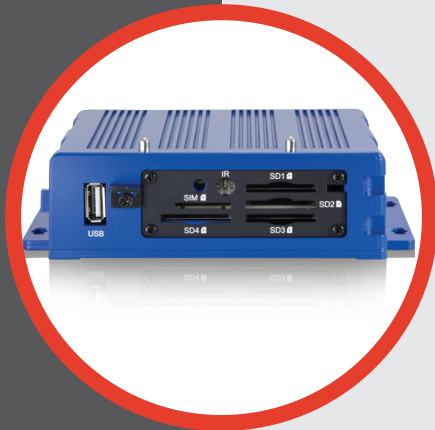
Electronic Control Unit (ECU)